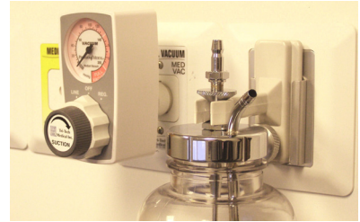
64-0603-6B with 64-0606 mounted on slide bracket with suction regulator