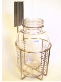
64-0003 with 64-0605