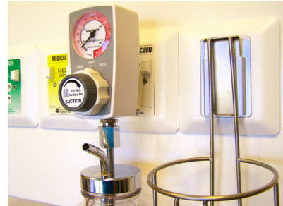
64-0603 with 64-0605 mounted on slide bracket with suction regulator

Tri-Tech Medical fluid waste collection bottles are designed with safety and economy in mind. Polycarbonate bottles are durable and reusable. Polycarbonate bottles may be autoclaved or sterilized with sterilizing gases and re-used many times. Polycarbonate bottles permit easy visual inspection of the collection bottle contents.